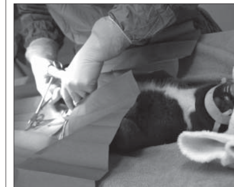
At the spay/neuter clinic in our sterile surgery suite.