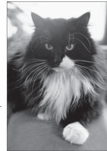
Mina at home.