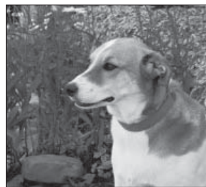
Mo in her backyard.

By her constant barking, Mo 'told' everyone in earshot that she needed to belong to someone again. She came to the Humane Society after several months of an unfruitful search for a new owner at Animal Control. Cooperation between the two shelters sometimes can find a forever home for an otherwise down-on-their-luck pet like Mo.