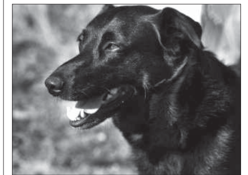
Dinah, a 5 year old Lab mix, was adopted in 2006 after being brought in to HSWM for escape issues.